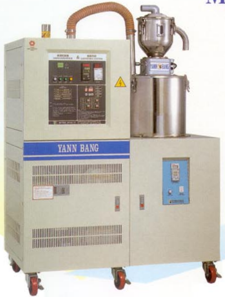
DHC-A SERIES MULTI-FUNCTION DESIGN 三機一體多功能型